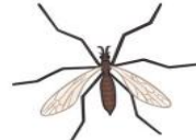
crane fly (daddy long legs)