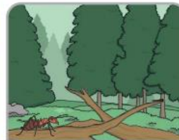
inside rotting wood